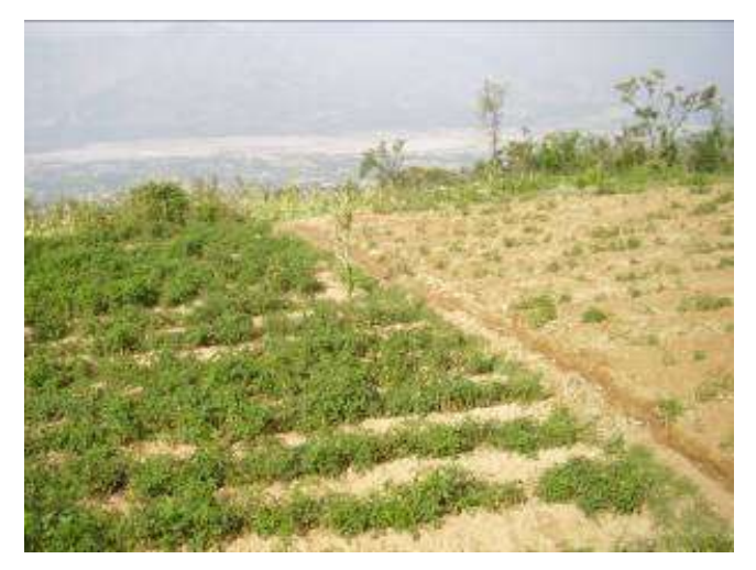
Picture 8: shows two tomato plots; the right one where substandard seeds were used and the left one where quality seed was provided by the project intervention

As stated earlier, the farmers and orchard growers were using fertilizers but were not aware of