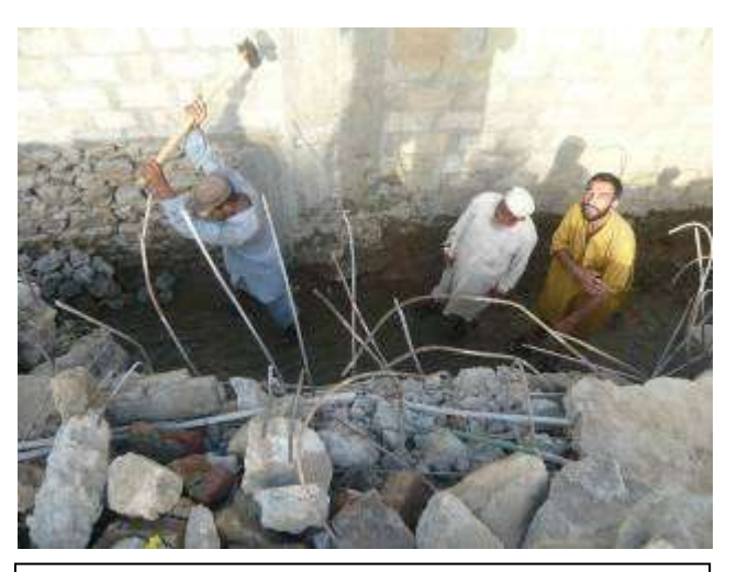
Picture7: Rehabilitation of Gullibagh Irrigation channel

Another measure is by looking at the cost of consumables and goods procured. Further analysis of purchase of seeds, fertilizers and equipments revealed that the efficiency in this task is much more than usual. This can be directly attributed to the fact that HOPE'87 secured contracts with vendors and were able to procure on whole sale price.